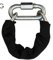
CNT-1 Chain Attachment Sling w/ Sleeve